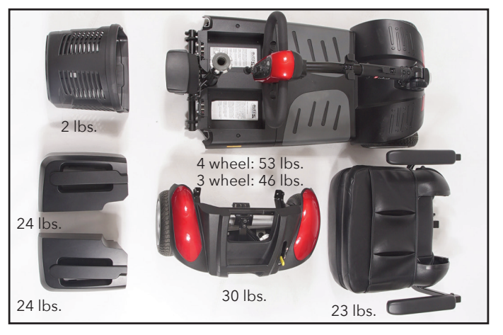
Disassembles into 6 pieces!