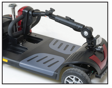
Step 3: Fold down tiller and lock in place!