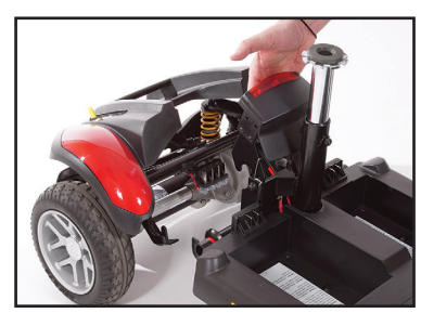
Step 4: Pull forward on the drivetrain release lever to separate the front and rear frame sections!