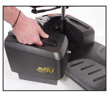
Step 2: Pull out the battery pack!