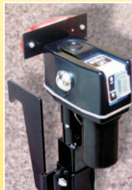
Hi-Torque Acme Actuator with an easy-to-operate switch, brake light, and built-in night lights. Emergency crank-through handle allows operation even when the battery fails.

It comes complete with simple wiring and installation instructions, owner's manual, and one-year limited factory warranty. Attractive waterproof covers for the Mobile-Lift are also available.