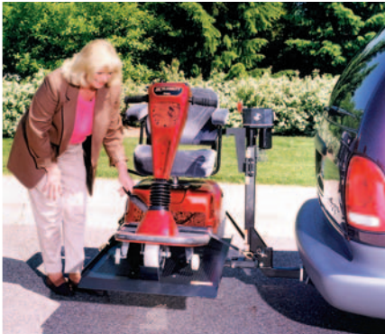
Once your scooter is on the platform and the brake is locked, push the switch to raise and stop halfway. Attach the adjustable safety belts. Finish raising until the Mobile-Lift automatically locks into place. Then just drive away!