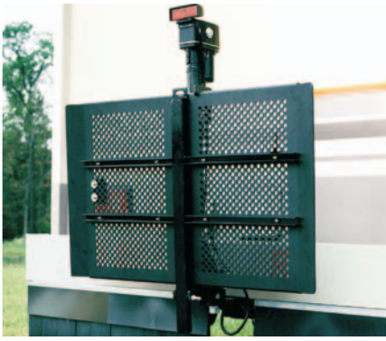
The Mobile-Lift Outside Model folds up out of the way when not in use. Just unfasten the lock-up strap and lower platform when ready to use.