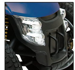
LED lighting package