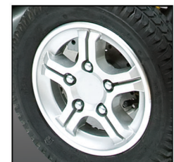
Large 13" pneumatic tires