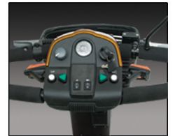
Delta tiller for optimal handling

The Pursuit ® XL is an exciting blend of power and precision that features full suspension, low-profile tires and a hydraulic-sealed brake system. Standard luxury touches like a wraparound delta tiller and LED lighting make it the ultimate outdoor scooter.