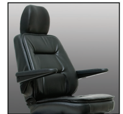
Pillow top seat with sliders