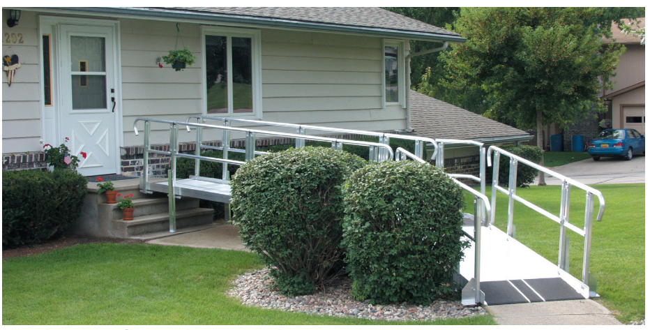
Multiple configurations possible.