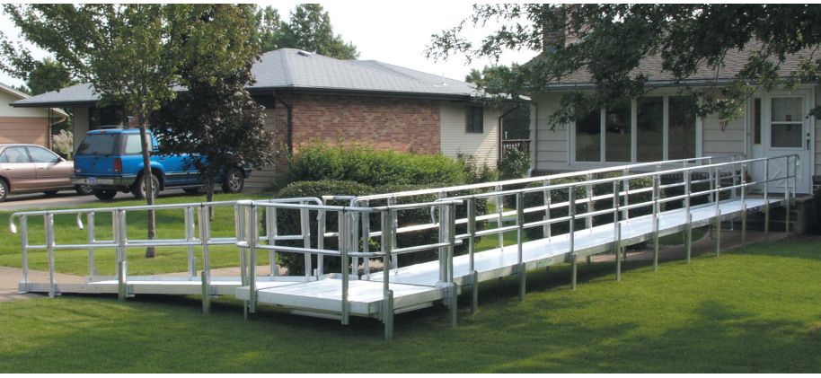
Optional handrail designs available upon request.