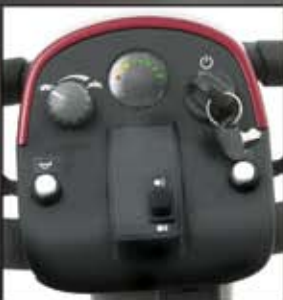
New LED battery meter for increased visibility