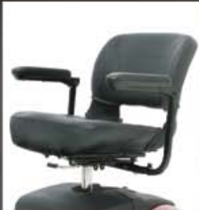
Lightweight seat with foam inserts and sliders