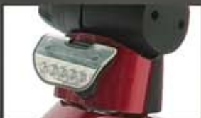
Long-lasting, high-intensity LED headlight offers optimal pathway illumination