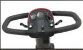
Delta tiller with wraparound handles

The sleek, sporty Victory® 10 scooter delivers high performance operation, all-new features and feather-touch disassembly. With a full complement of advanced standard features like exclusive low-profile tires, LED battery gauge, and wraparound delta tiller, the Victory® 10 is a greater value than ever before.