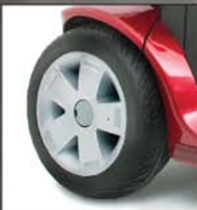
Pride's exclusive stylish, light weight, non-marking low profile wheels