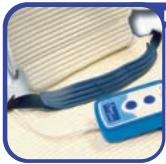
BL115 Lap Harness with Pommel

Ensures occupant safety by preventing any slippage for patients with compromised upper body strength.