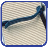
BL110 Chest Harness with Pommel

Eases entry and exit from your bath. Our most popular accessory.