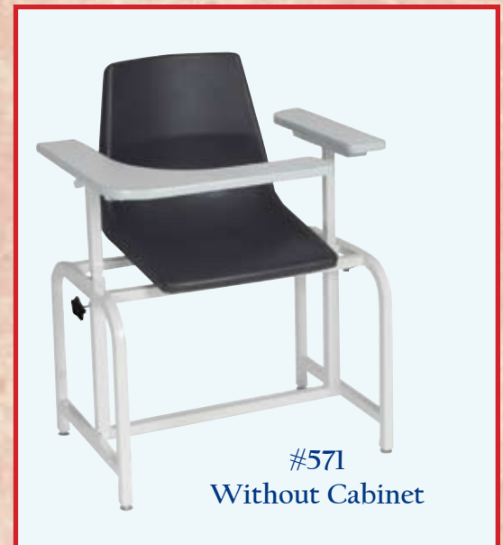
#571 Without Cabinet