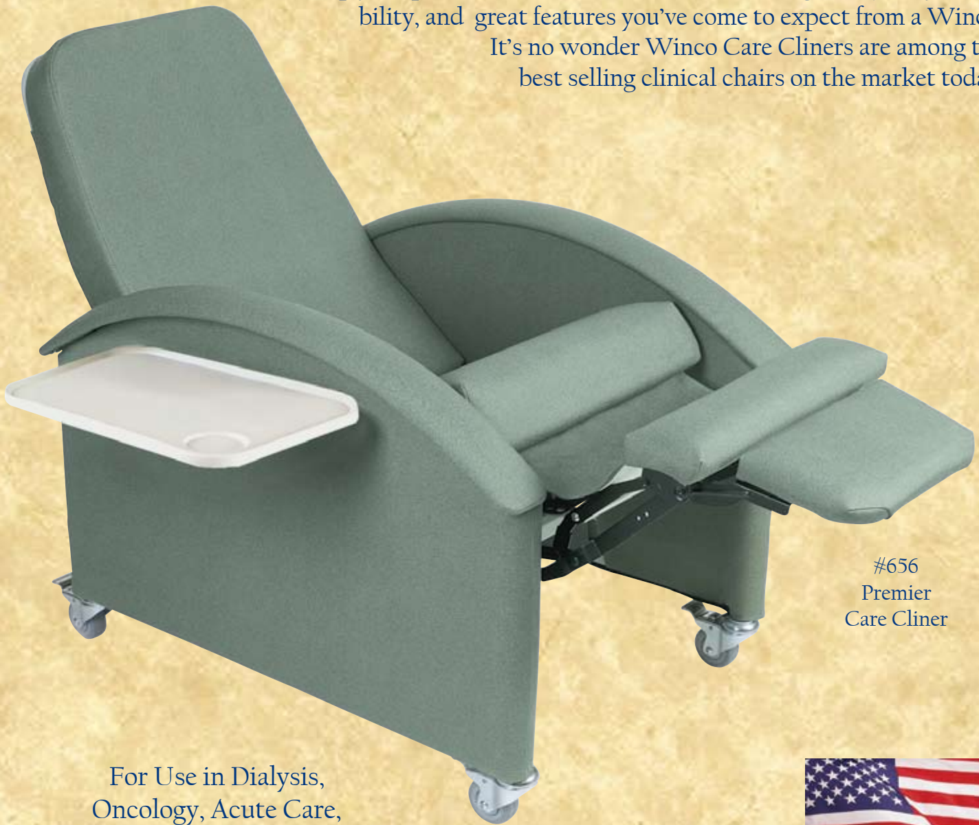
#656 Premier Care Cliner

Our Premier Care Cliner has a uniquely smooth, contemporary design to help your patients feel at ease, while maintaining the quality, durability, and great features you've come to expect from a Winco. It's no wonder Winco Care Cliners are among the best selling clinical chairs on the market today!