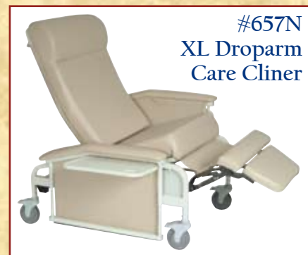
#657N XL Droparm Care Cliner